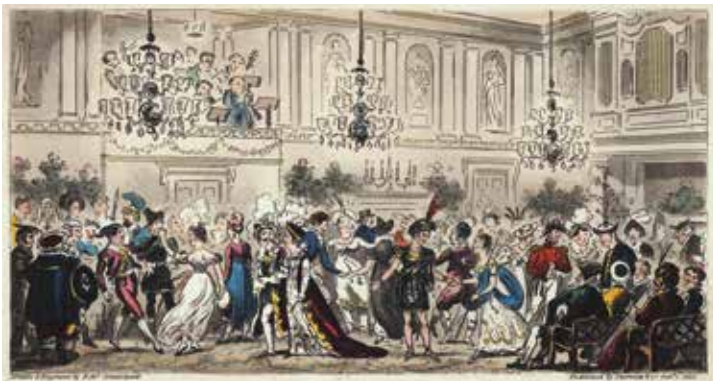
Fancy Ball at the Upper Rooms, Bath by Robert Isaac Cruikshank, 1825