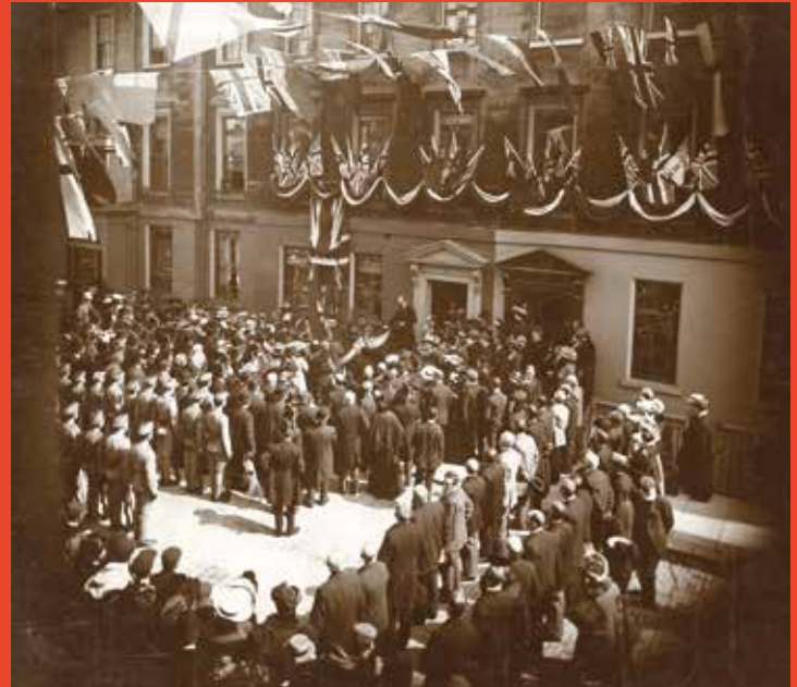
Unveiling a bronze plaque to Admiral Lord Nelson 2, Pierrepont Street, Bath in 1900 © Bath in Time.

Almost everyone had heard of the famous but mystical healing properties of Bath's thermal spring waters, and Nelson believed the stories implicitly. Accordingly, the Bath Journal of 22nd January 1781 proclaimed Nelson's arrival in the town in its customary roll-call of visiting dignitaries.