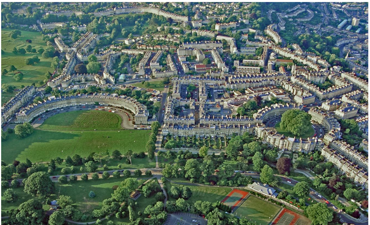
Aerial view of the Circus and Royal Crescent

New types of architecture appeared including squares, crescents and the Circus. Attractive views to the green hills beyond were deliberately created.